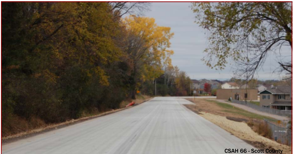
CSAH 66 - Scott County

Join us for the Concrete Paving Association of Minnesota's