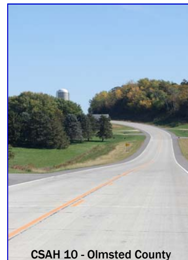
CSAH 10 - Olmsted County